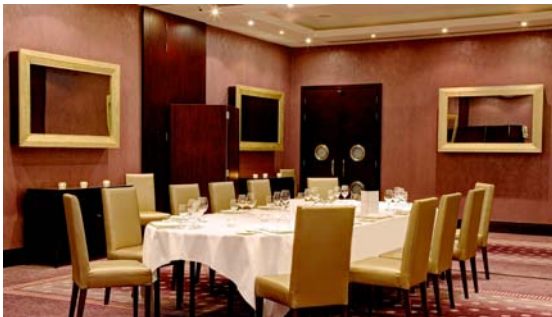
The Westminster Suite