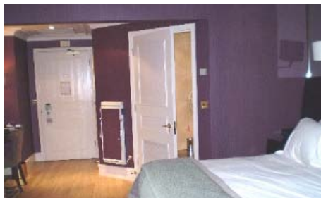
The accessible bedroom