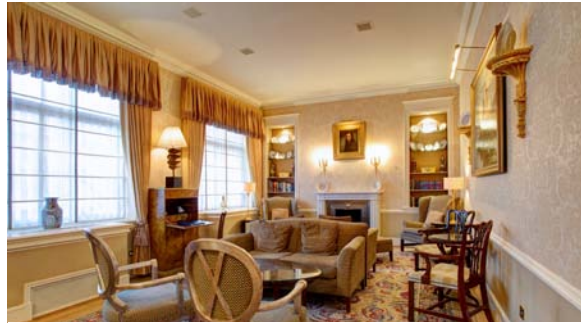
The Drawing Room