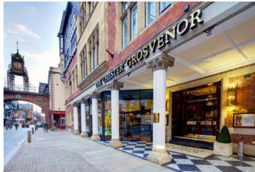
The Main Entrance

We have 80 bedrooms with one accessible bedroom suitable for wheelchair users accessed via a lift. The en-suite bathroom has a level entry shower with handrails fitted throughout. All bedrooms have en-suite bathrooms. The room is interconnected to a non-accessible bedroom.