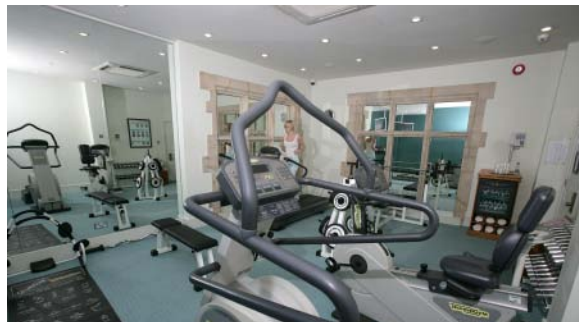
The Fitness Centre