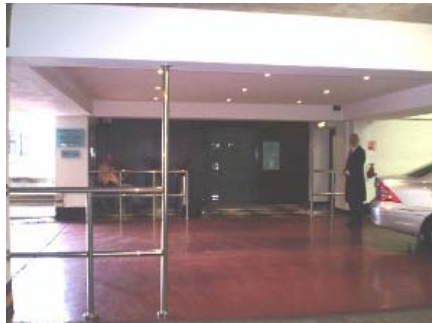
Access to the hotel via level 2A of the Grosvenor Shopping Centre car park.