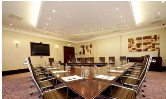
The Executive Boardroom